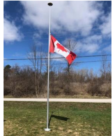
Fly your flag at Half-Staff using the 2 lower flag snaps